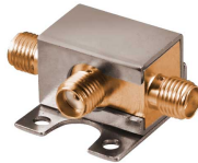
CASE STYLE: FL905